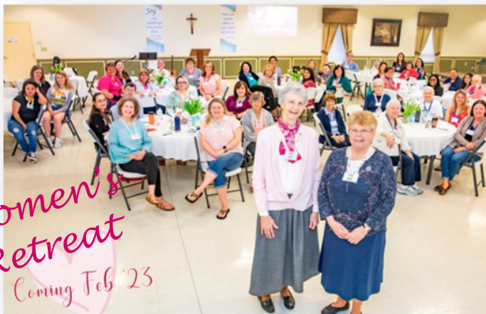
Women's Retreat Coming Feb 23