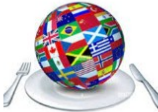
Dining Around the World

It is happening live! Fellowship and different delicacies around the world will be available in the social hall on Saturday, February 18 at 6pm . Grab your tickets after Mass. It's only $10 now, but $12 at the door.