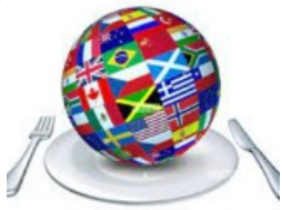
Dining Around the World

After each mass tickets will be sold for this event. The Church needs volunteers to cook their favorite family plate recipes to meet the demand. Please sign up to bring a plate to share. Sign-up sheets are at the narthex of the Church. Thanks in advance.