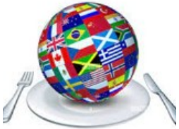
Dining Around the World

Tickets are selling like "hot potatoes." The Church needs volunteers to cook their favorite family plate recipes to meet the demand. Please sign up to bring a plate to share. Sign-up sheets are at the narthex of the Church. Thanks in advance.