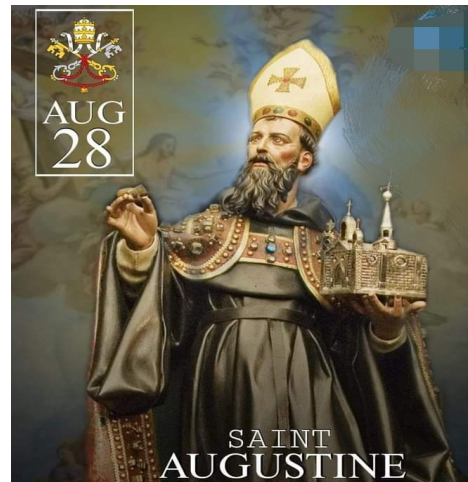
Parish Celebration of the Feast of St. Augustine August 22-28

Please remember that children 12-years old and under should be accompanied to the bathroom by a parent/guardian. Youth under the age of 16 should not leave the sanctuary without a parent/guardian. We appreciate your help in protecting our youth.