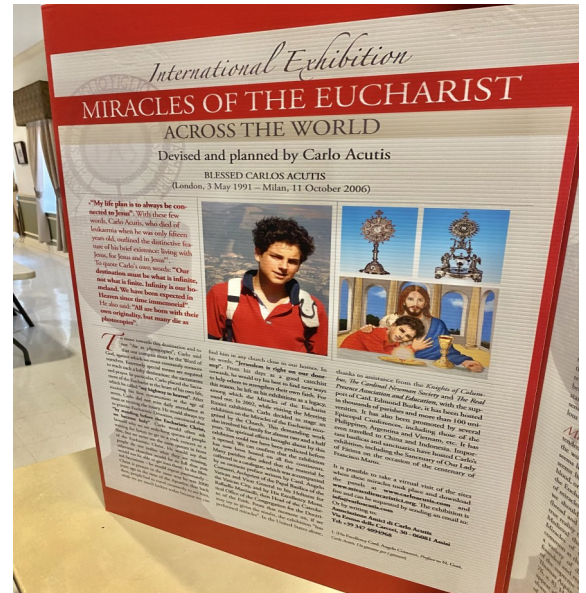
International Exhibition Miracles of the Eucharistic around the world on display in the Social Hall at St. Augustine until Nov 27

We are also in need of sponsors who will assist the RCIA candidates on their spiritual journey.